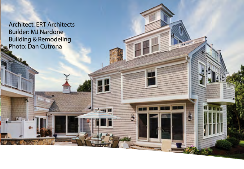
Architect: ERT Architects Builder: MJ Nardone Building & Remodeling

At Home on Cape Cod is quickly becoming the standard for the sophisticated consumer who appreciates quality in design, building, remodeling and home improvement on Cape Cod.