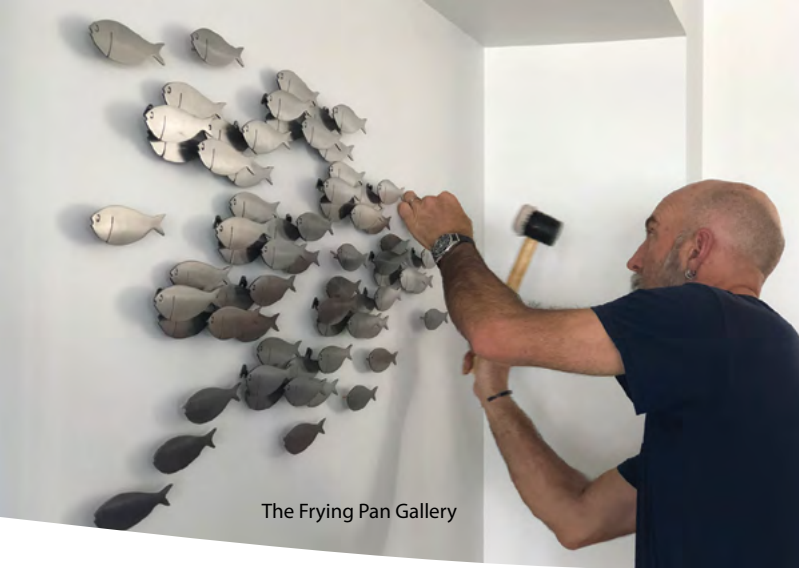
The Frying Pan Gallery