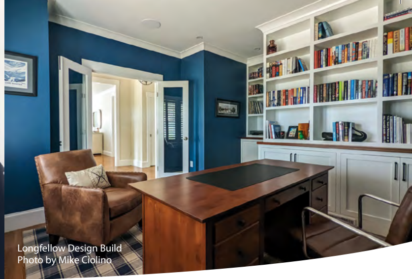
Longfellow Design Build