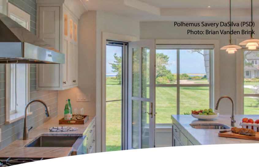
Polhemus Savery DaSilva (PSD)